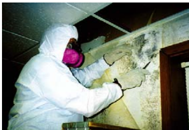
Remediation and Personnel Protective Equipment