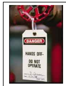
Lock and/or Tag all Sources